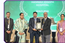
HANNAH JOSEPH HOSPITAL MADURAI