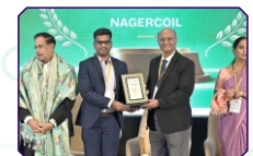
KIMS HEALTH NAGERCOIL NAGERCOIL