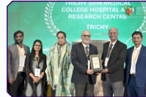
TRICHY SRM MEDICAL COLLEGE HOSPITAL & RESEARCH CENTER TRICHY