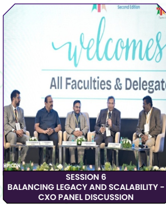
SESSION 6 BALANCING LEGACY AND SCALABILITY - CXO PANEL DISCUSSION