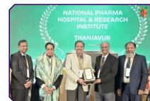
NATIONAL PHARMA HOSPITAL & RESEARCH INSTITUTE