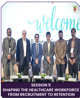
SESSION 5 SHAPING THE HEALTHCARE WORKFORCE FROM RECRUITMENT TO RETENTION