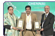
APOLLO CHILDREN'S HOSPITAL CHENNAI