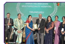
ANNAI VELANKANNI MULTISPECIALTY HOSPITAL TIRUNELVELI