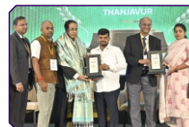
SRI KAMATCHI HOSPITAL THANJAVUR