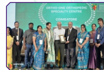
ORTHO ONE ORTHOPEDIC SPECIALTY CENTRE COIMBATORE