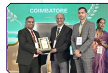
KARUNYA HOSPITALS COIMBATORE