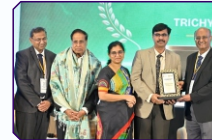
MUKESH ARTHO CARE HOSPITAL TRICHY