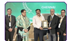
SRI RAMACHANDRA MEDICAL CENTRE CHENNAI