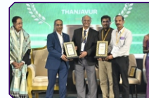
MEENAKSHI HOSPITAL THANJAVUR