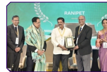
THIRUMALAI MISSION HOSPITAL RANIPET