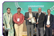
KARPAGAM HOSPITAL COIMBATORE