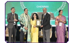
FRONTIER LIFELINE HOSPITAL CHENNAI