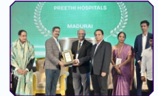
PREETHI HOSPITALS MADURAI