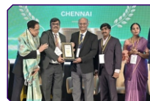
KANCHI KAMAKOTI CHILD'S TRUST HOSPITAL CHENNAI