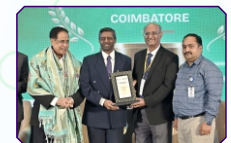
KMCH - IHSR COIMBATORE