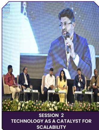
SESSION 2 TECHNOLOGY AS A CATALYST FOR SCALABILITY