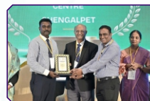
SRM MEDICAL COLLEGE HOSPITAL & RESEARCH CENTRE CHENGALPET