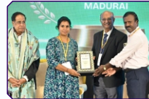
MEENAKSHI SUPER SPECIALTY HOSPITAL MADURAI