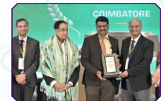
ROYAL CARE SUPER SPECIALTY HOSPITAL COIMBATORE