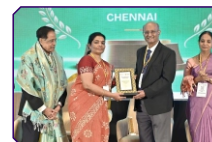
PARVATHY HOSPITAL CHENNAI