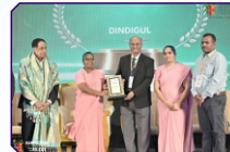
ST JOSEPH HOSPITAL DINDIGUL