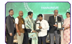
SRI KAMATCHI HOSPITAL THANJAVUR