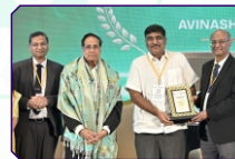
MATHESWARI MEDICAL CENTRE & HOSPITAL AVINASHI