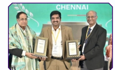
APOLLO HOSPITALS GREAMS ROAD