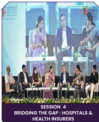
SESSION 4 BRIDGING THE GAP: HOSPITALS & HEALTH INSURERS