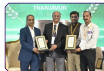
MEENAKSHI HOSPITAL THANJAVUR