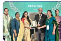
SRINGERI SHARADA EQUITAS HOSPITAL CHENNAI