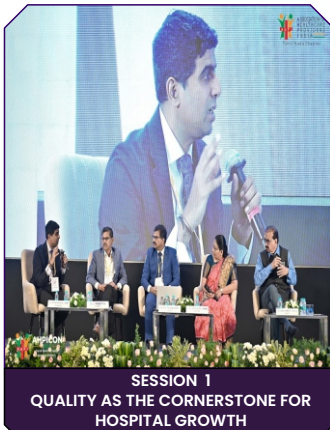
SESSION 1 QUALITY AS THE CORNERSTONE FOR HOSPITAL GROWTH