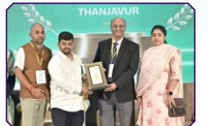
SRI KAMATCHI HOSPITAL THANJAVUR