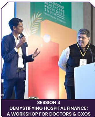
SESSION 3 DEMYSTIFYING HOSPITAL FINANCE: A WORKSHOP FOR DOCTORS & CXOS