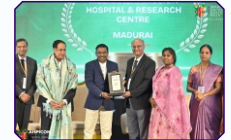
MEENAKSHI MISSION HOSPITAL & RESEARCH CENTER MADURAI